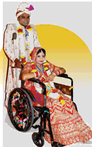
Mass Wedding for Physical Handicapped & Poor couple